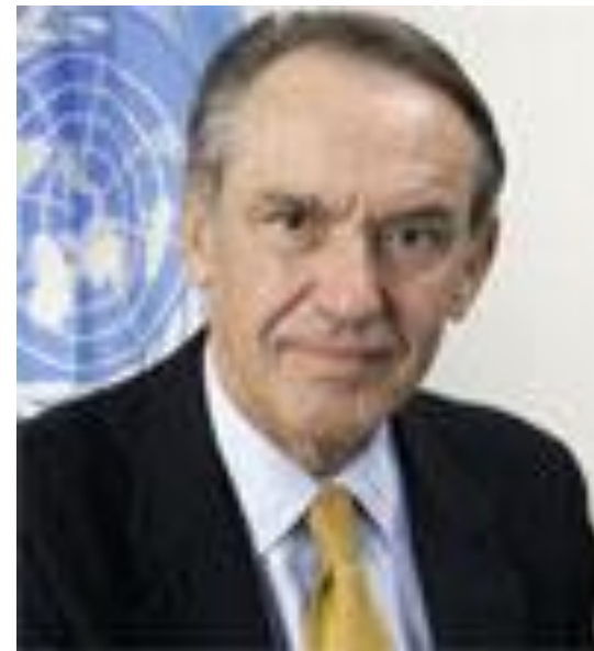
Deputy Secretary General of the United Nations